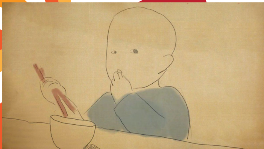
Still from TET by James Tran as part of Colourfest Film Festival.

"The idea of these workshops is to literally take people outside of this space, to imagine the future, to articulate a timeline and then to action that. It is important for this work to be done by the CaLD artists themselves – to imagine the creative cultural landscape that we want to be in."