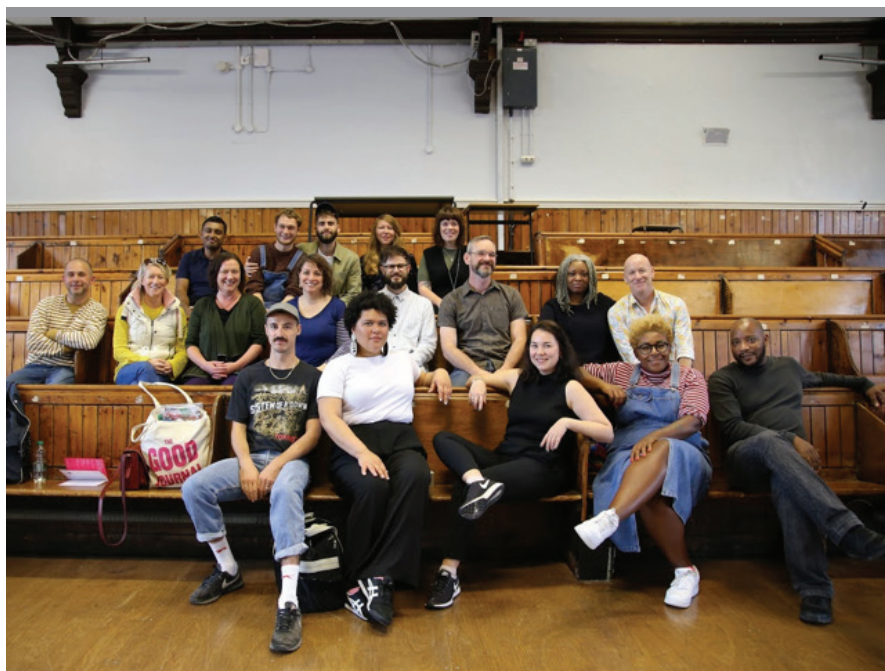
Intersect Artist Exchange 2018

"INTERSECT seeks to strengthen diversity and opportunity in a place where power lies – among those who decide whose work is seen, what is seen, how it is seen and who sees it, thereby multiplying the impact."