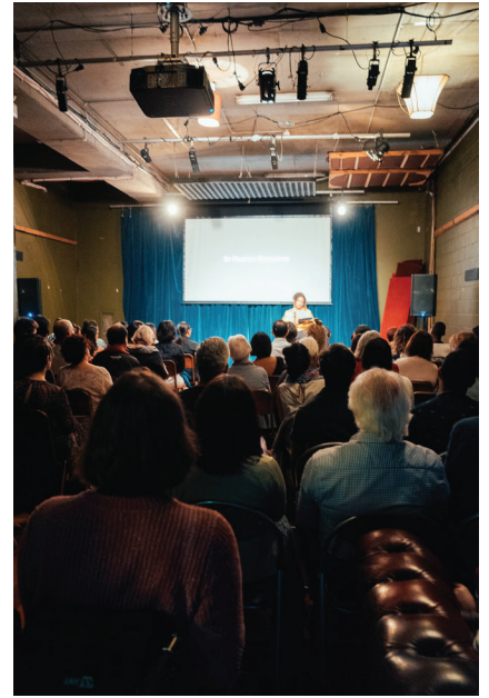
Citizen Writes Event Launch.

Find out more: http://diversityarts.org.au/project/citizen-writes