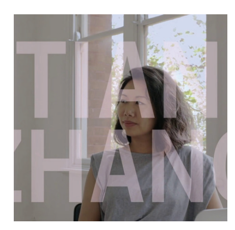
Photo above Still from Sarinah Masukor's short film 'Polychromatic'.

Citizen Writes Launch.